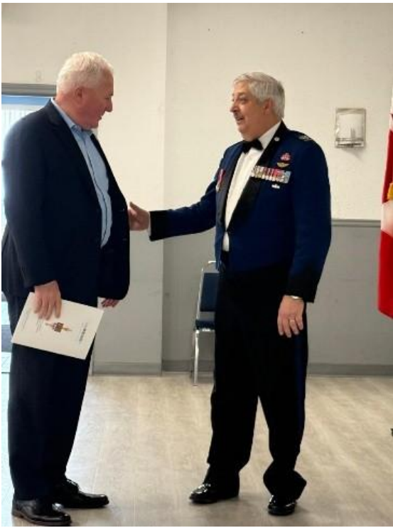
Member of Parliament John Brassard