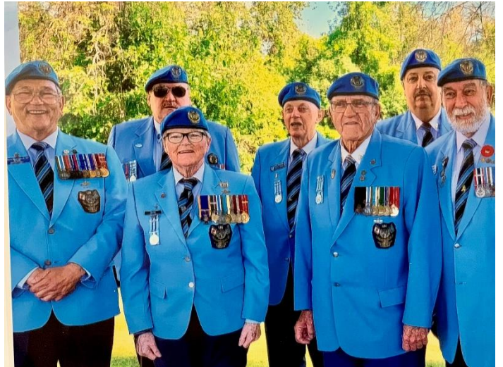
Some of the CAVUNP attendees