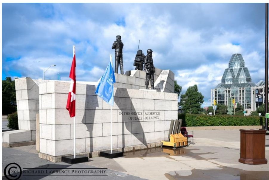
Reconciliation Monument – 13th August 2023

On the 9th of August, 1974, a United Nations Buffalo aircraft flying over Egypt was shot out of the sky by a Syrian air defence missile. On that plane were nine Canadian Armed Forces personnel involved in a peacekeeping mission who were killed on what was supposed to be a routine resupply mission to the presence in the Golan Heights. To this day, it is still the largest single loss of Canadian lives since Canada began participating in UN Peacekeeping missions in 1948. That is why the closest Sunday to the 9th of August is selected as National Peacekeepers' Day every year with this year's remembrance ceremony being held at the Reconciliation Monument, Ottawa, on Sunday the 13th on what as perfect day of moderate temperatures with a mix of sun and cloud.